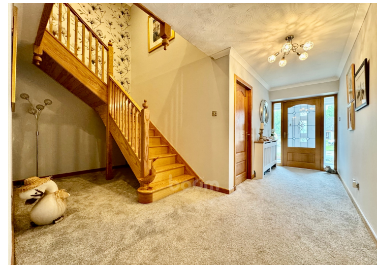
5 Kirkstyle Court, Girdle Toll, Irvine