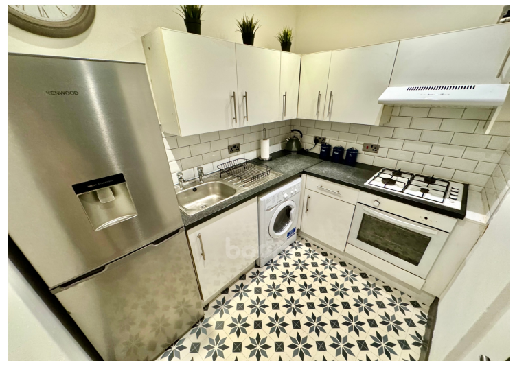
249 (Flat 0/2) Wellshot Road, Glasgow