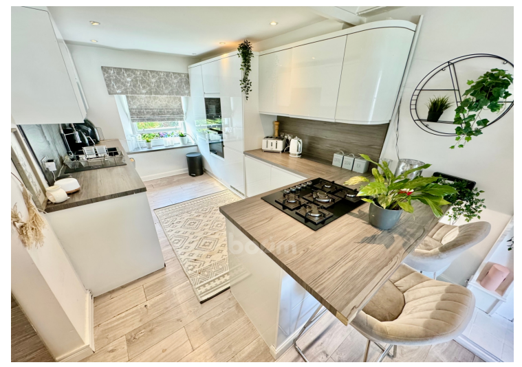
Low Barholm, Kilbarchan