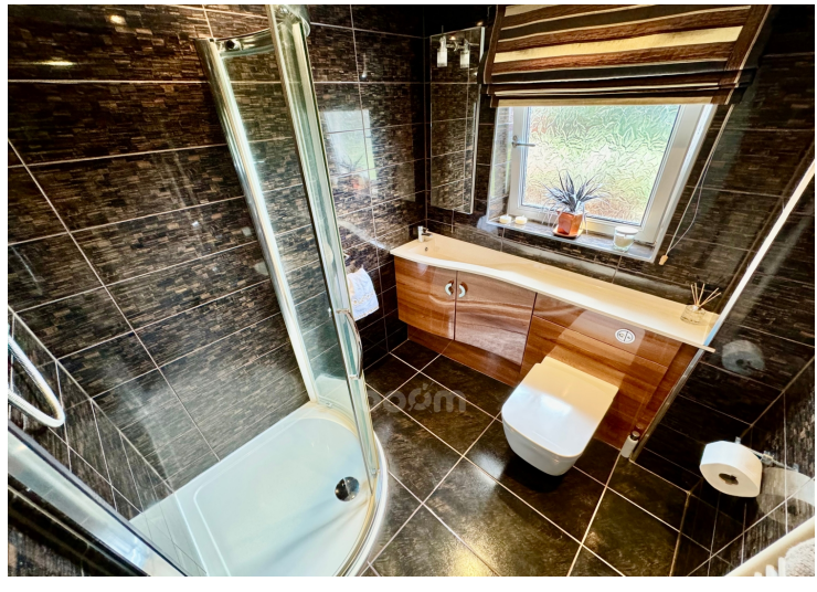
9 Smithstone Court, Girdle Toll, Irvine