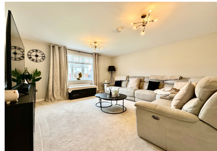
48 Doulton Road, Paisley