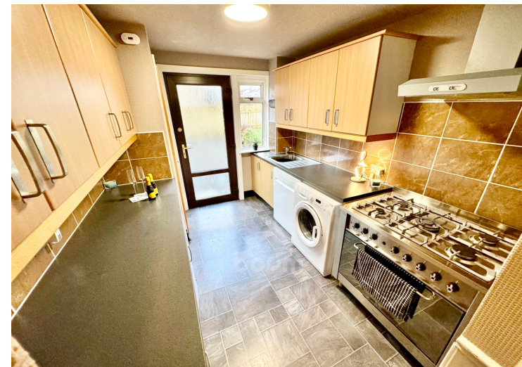
11 Hagthorn Avenue, Kilbirnie