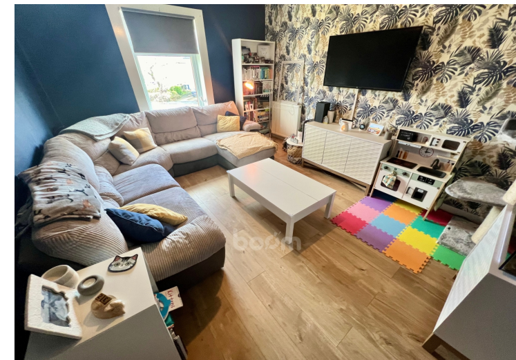
64 Central Avenue, Kilbirnie