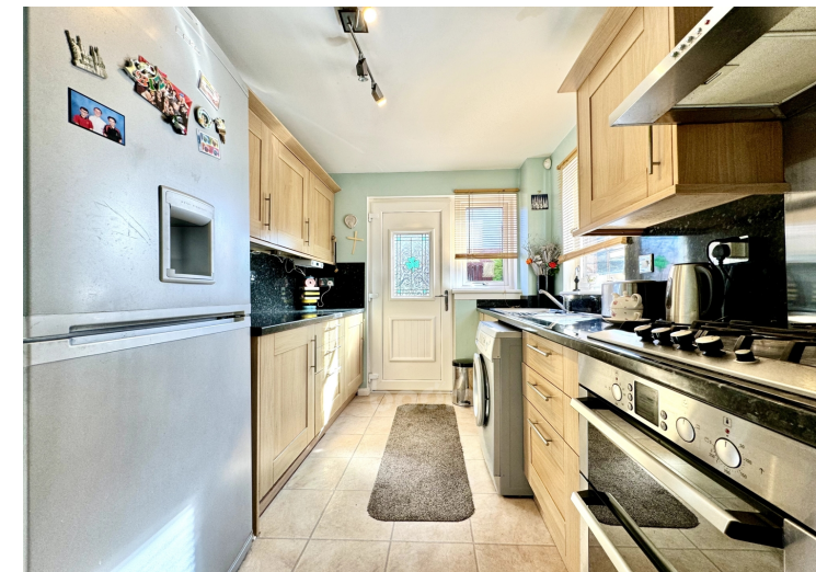
183 Springfield Park, Johnstone