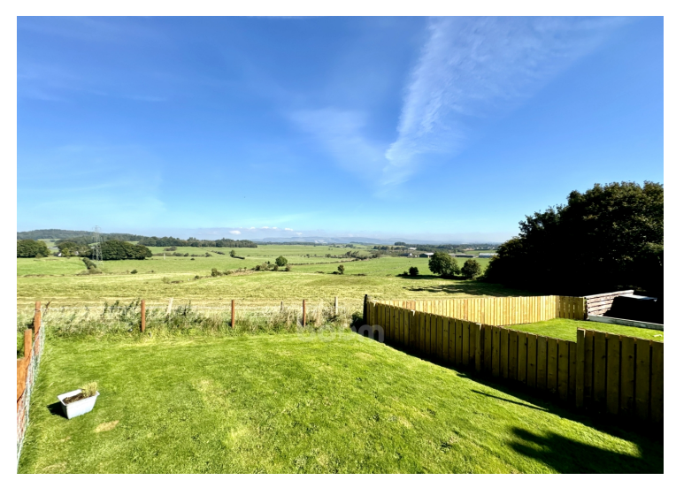
46 Park Road, Bridge of Weir