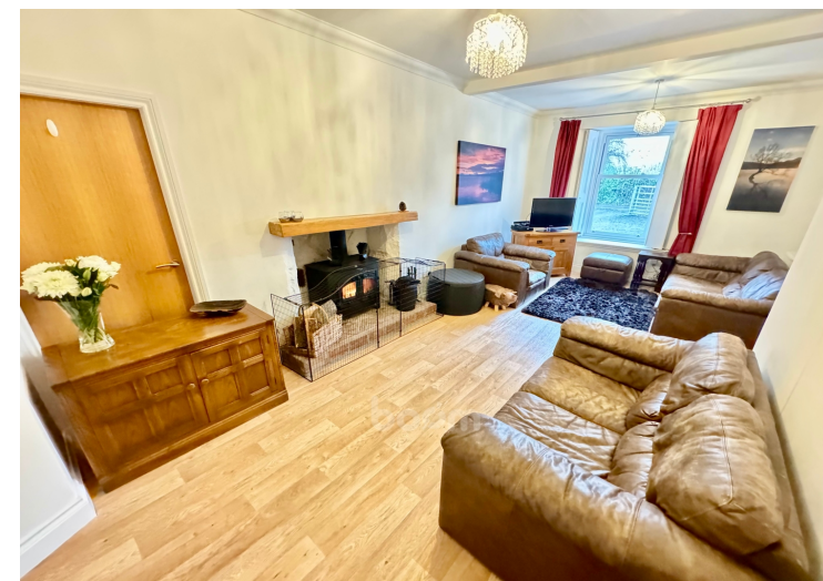
Bellevue Cottage, Off Lochfaulds Road, Beith