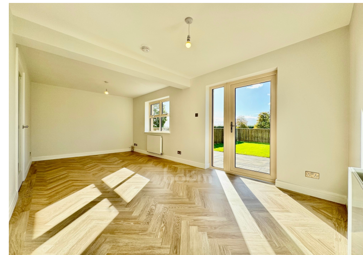
9 Selvieland Farm Cottages, Houston Road, Houston