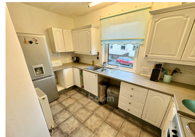
15 Kirkbride Crescent, Crosshill, Maybole