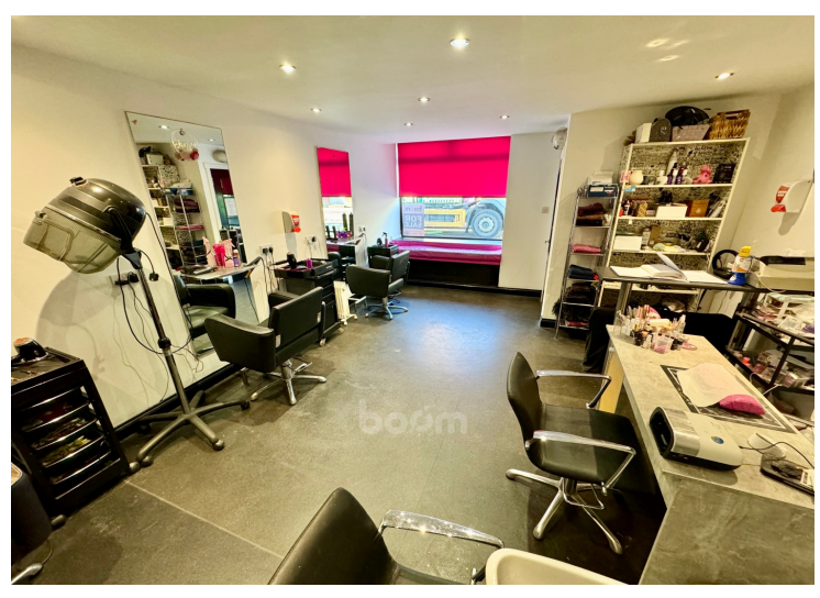
80 Main Street, Kilbirnie