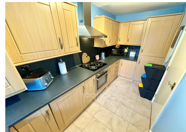
81 Foundry Wynd, Kilwinning