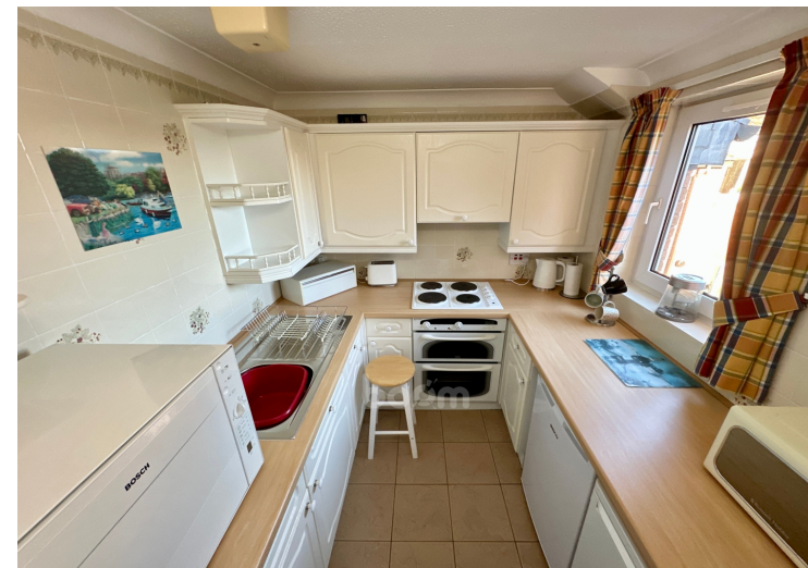
40 Homeshaw House, 27 Broomhill Gardens, Newton Mearns