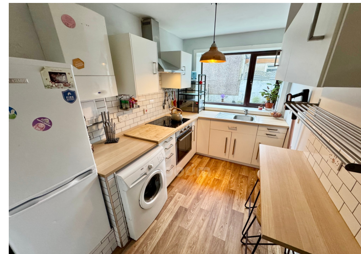
90 New Street, Dalry