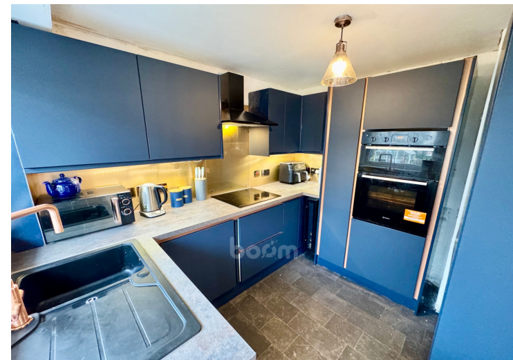
6 Parkview Drive, Stepps