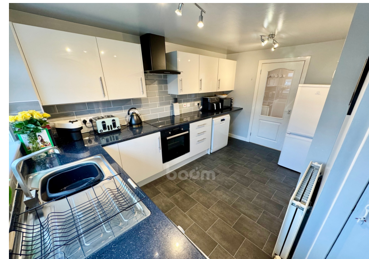
36 Finch Place, Spateston