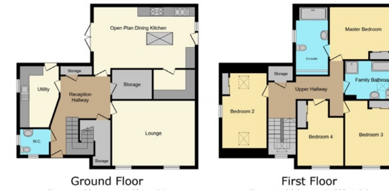
NO.4 Torr Farm