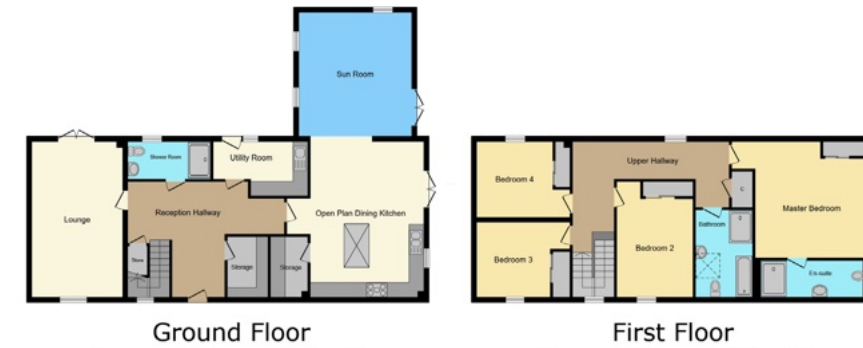
NO.2 Torr Farm