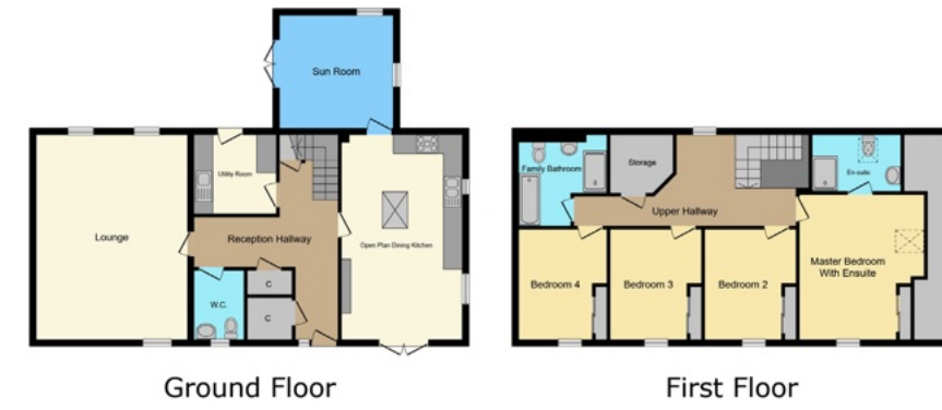
NO.1 Torr Farm