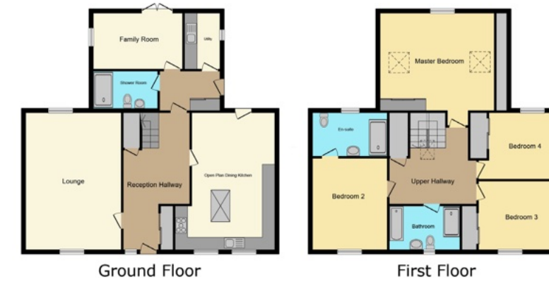
NO.3 Torr Farm